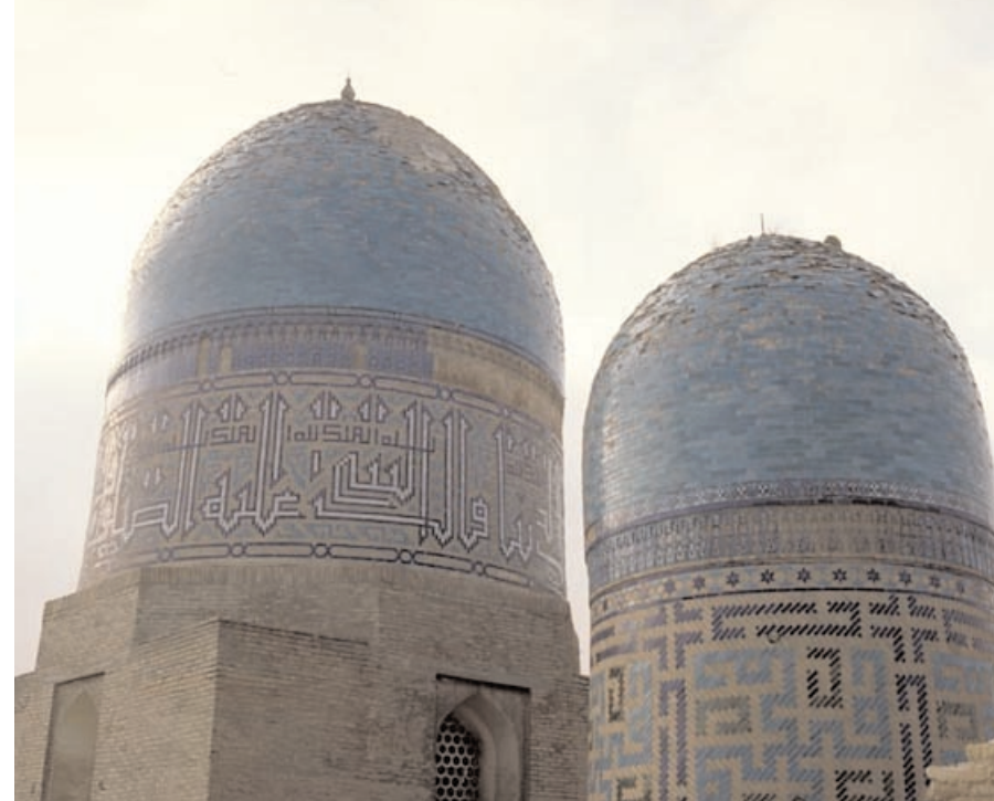
Top left: Steps and Shadows II, modern Cubic Kufi by Mamoun Sakkal. Left: Analysis of the band design at Alkazar palace showing how the calligraphy can be read in both blue and white. Above: The mausoleum of the astronomer Ghazi-Zade Rumi in Samarkand, built in 1437 AD

Square Kufi requires tremendous skill since the artisan has to fit the calligraphy within defined borders in such a way that all letters fit next to one another in a uniform manner. There can't be any gaps or overlaps. Because of the uniformity of the shapes used in Square Kufi (only straight lines and right angles are allowed), its compositions can be easily mistaken for interesting decorative patterns, and the calligraphic content completely obscured from those not already familiar with its beauty – and this must be what happened with Pedro I. He saw an angular geometric pattern. Yet Arabic readers could discern the Nasrid slogan.